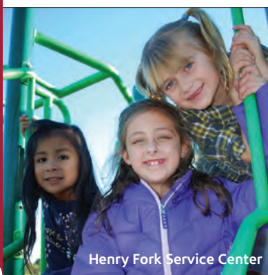
Henry Fork Service Center

Special Program and Sustaining grants to local churches/faith groups reaching out into communities