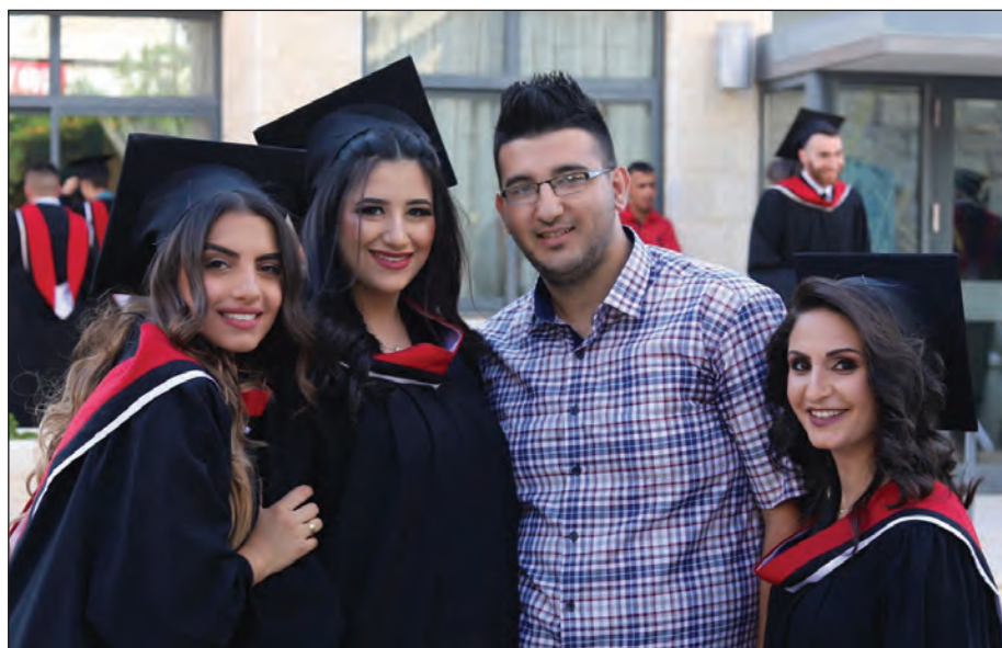
Graduates from the Bethlehem Bible College.