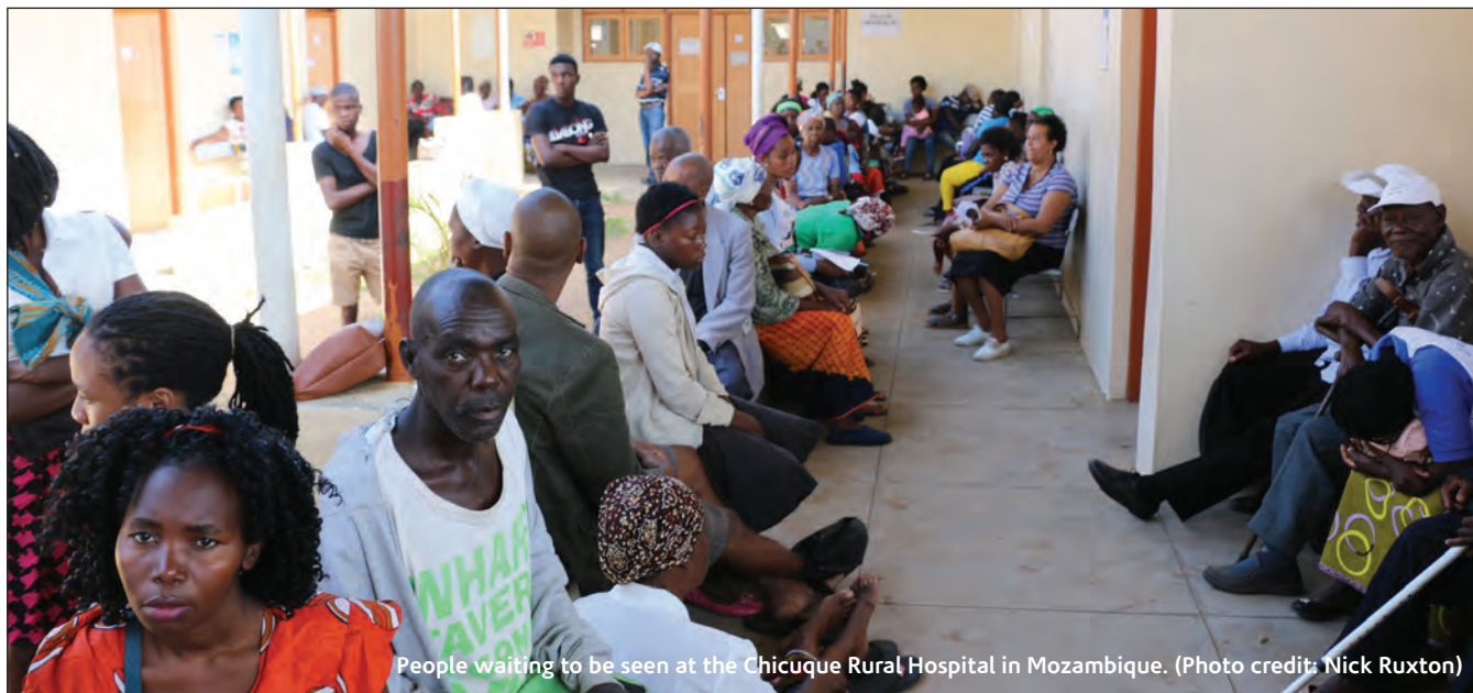
People waiting to be seen at the Chicique Rural Hospital in Mozambique.