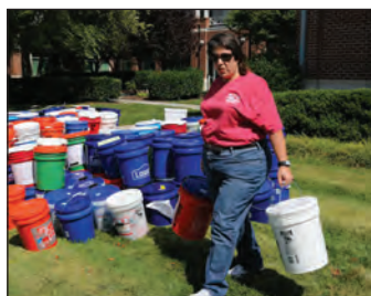
Collecting flood buckets for the Texas hurricane.

F or many people around the world, and even our neighbors here in the U.S., their first connection with The United Methodist Church is through the United Methodist Committee on Relief (UMCOR) serving as the relief and humanitarian arm of The United Methodist Church. Our goal is to assist the most vulnerable persons affected by crisis or chronic need without regard to their race, religion, gender or sexual orientation. UMCOR believes all people have God-given worth and dignity.