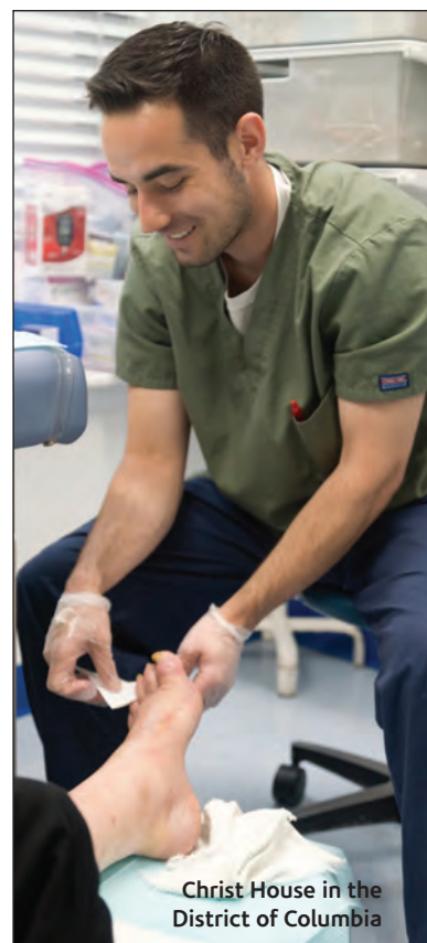
Christ House in the District of Columbia