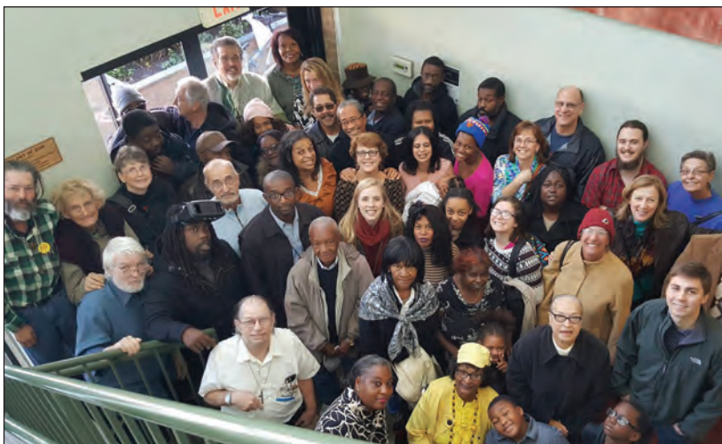
(Below) Rising Hope UMC in Alexandria