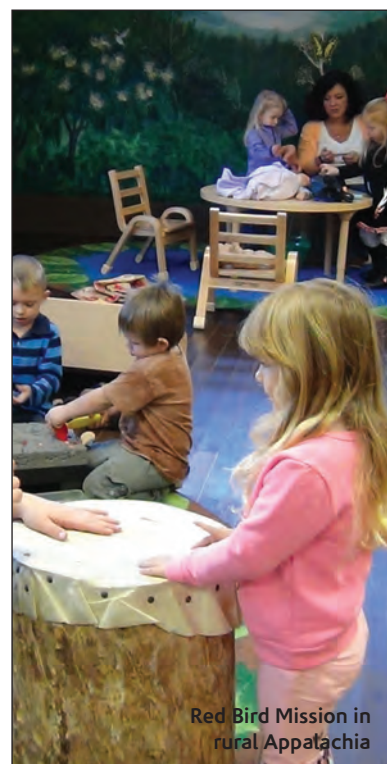
Red Bird Mission in rural Appalachia