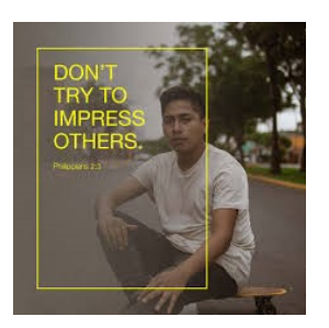
"Do nothing out of selfish ambition or vain conceit. Rather, in humility value others above yourselves..." <u>Philippians 2:3 (NIV)</u>

Otherwebinar topics will include mentoring, prison and jail ministries, scouting, and hunger relief. Continue reading this issue of The BEACON and visit our web site <u>vaumc.org/UMM</u> for details on topics, dates, time, how to connect, and recordings.