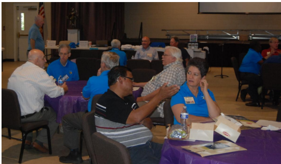
Lunch conversations on Saturday.