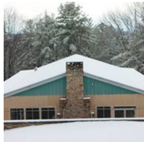
Meeting God on the Mountain