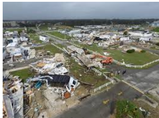
Dorian Destruction in NC