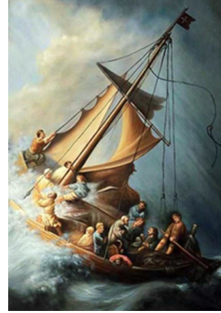
Rembrandt van Rijn. Christ in the Storm on the Sea of Galilee, 1633.

As men of faith we need to become open-minded and open-hearted. Hard hearts won't see or hear the message. Closed minds will not comprehend the message or will reject it. The disciples were of course new to this radical, revolutionary message of following God rather than a bunch of rules, so at first, they didn't understand. But their trust grew and their hearts and minds were opened through the love of Jesus!