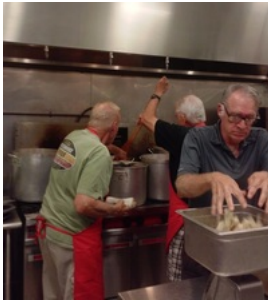
Brunswick Stew Sales