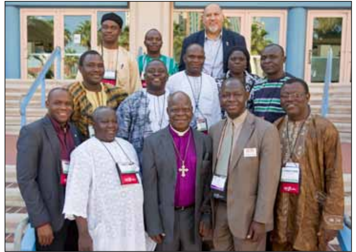
Delegates from the Nigeria Conference gather on the steps of the Tampa Convention Center, site of the 2012 United Methodist General Conference.

"It was difficult for the original group that founded it to accept the leadership of this new people who came into the church," he said.