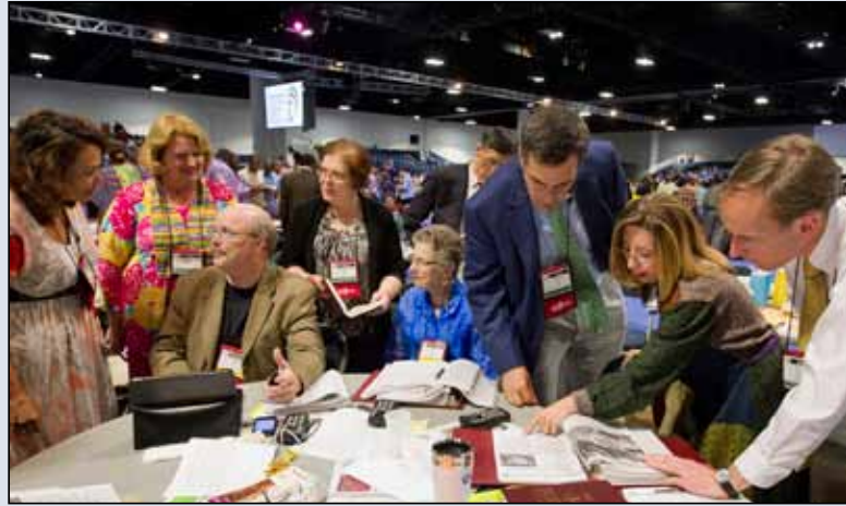
Virginia delegates huddle to discuss possible restructuring options on the final day of General Conference.

Proponents of restructure disregarded this assessment and asked the plenary as General Conference began its final session to refer “Plan UMC” to the Connectional Table and Council of Bishops to perfect. They also suggested calling a special General Conference before 2016 to consider whatever the bishops and Connectional Table perfected.