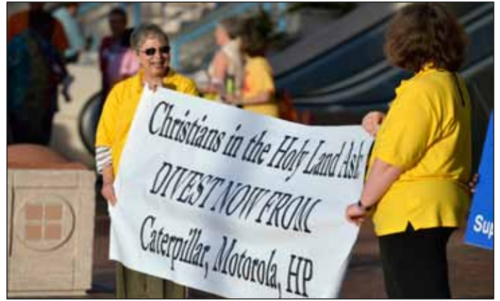
Volunteers hold up a banner asking delegates to approve a plan of divestment from Caterpillar, Motorola and Hewlett-Packard.

A minority report urging divestment and calling on United Methodist boards, agencies, annual conferences and local