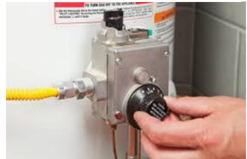
Set at 110-120 degrees (manufacture default to 140 degrees)