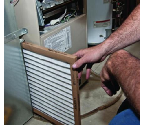
Dirty air filters can seriously cut HVAC efficiency