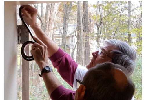
Apply weather stripping around doors.