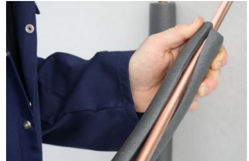
Insulate hot water pipes