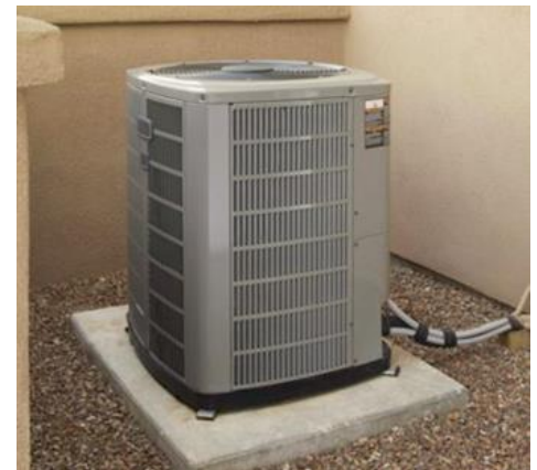
Upgrade HVAC systems with efficient models that do not use CFCs or HFC refrigerants