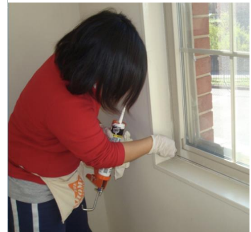
Patch cracks around windows.

Use your Zip Code in the rebate finders for ENERGY STAR® and WaterSense® labeled products to check on utility or retail vendor rebates before you buy any products.