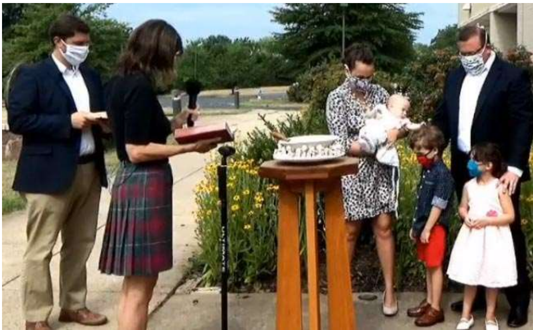
Grace UMC Baptism