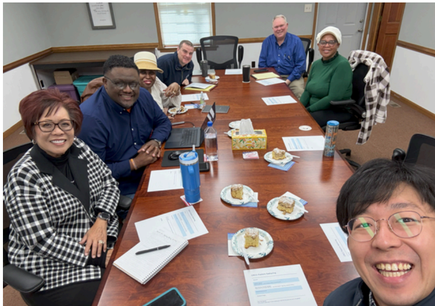
CAPTION: CROSS-CULTURAL AND MINORITY PASTORS MEETING