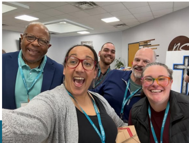
CAPTION: TAKING A PICTURE AT THE HOSPITALITY WORKSHOP