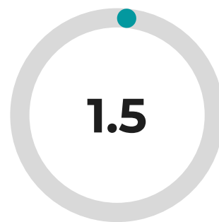
Q1 2026 increase over Q1 2025 apportionments