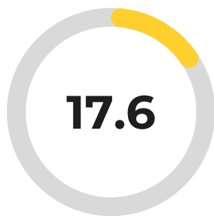
2026 First Quarter apportionment collection

Despite winter weather challenges that impacted church attendance, the Annual Conference collected 17.6% of Conference Apportionments in the first quarter of 2026. This is an increase of 1.5% over Q1 2025. The shift from apportioning Active Clergy Health in 2025 to Direct Bill Health in 2026 is showing an overall positive result both for the Conference Apportionments and for our Pensions office (VUMPI). This shift appears to have given local churches a greater ability to support the Connection. District Apportionment collections have also reflected a positive increase in collection percentage from 18.4% Q1 2025 to 19.3% in Q1 2026.