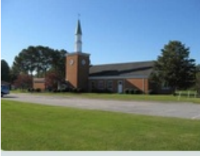
St. Paul's UMC

District UMM and then, two years later, as President/Team Leader, a position which has a seat on the Virginia Conference UMM Cabinet.