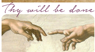
2016 VIRGINIA ANNUAL CONFERENCE

Welcome to the 234th Virginia Annual Conference, Berglund Center, Roanoke, Virginia