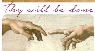
2016 VIRGINIA ANNUAL CONFERENCE