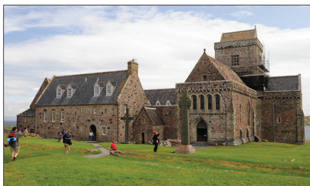
The monastery at Iona, Scotland.