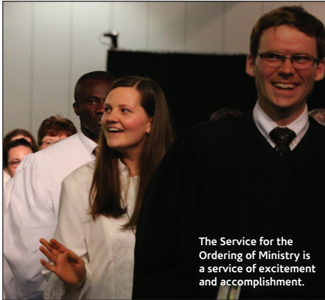
The Service for the Ordering of Ministry is a service of excitement and accomplishment.