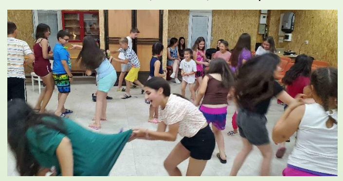
Trying not to get clipped with clothespins! Click here to watch.

On the first morning, we talked about how having a map can really help us navigate the jungle so we don't get lost and how God has given us a map for our lives called the Bible. Each group was given a treasure map to follow to find three eggs hidden somewhere around the camp. In each egg was a treasure that we can find in the Bible along with a verse. Once a group found all their eggs, they could go to a quiet place to open them and discuss the treasures inside: Truth, wisdom, and hope.