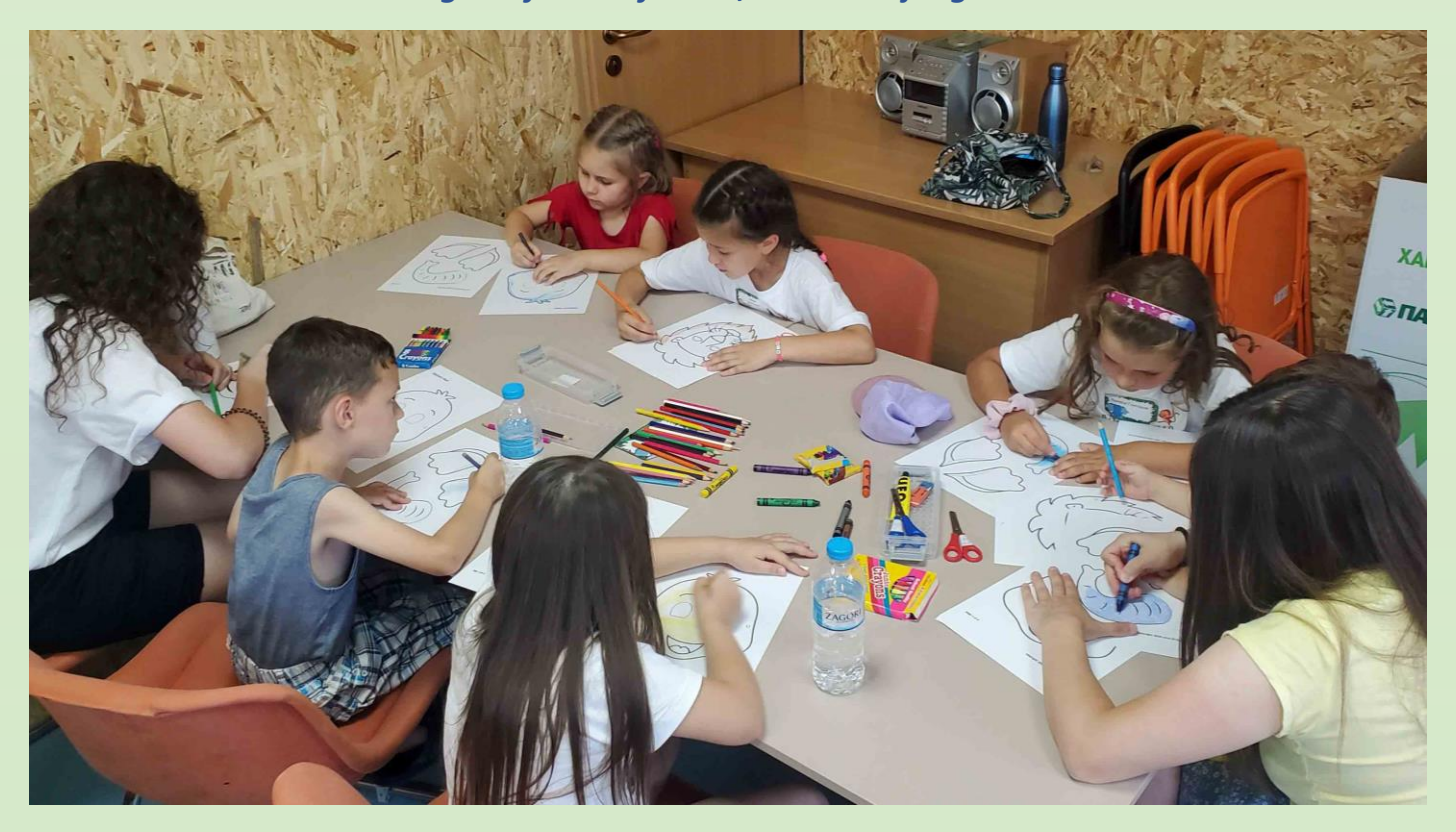
Here we are in our masks @