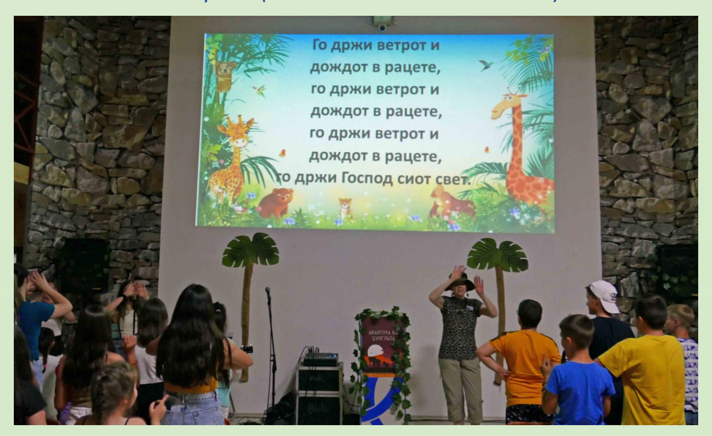
Who's the King of the Jungle? (Click the photo to find out)